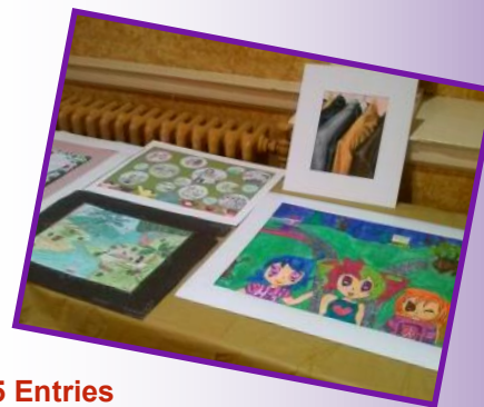
Reflections 2014-2015 Entries